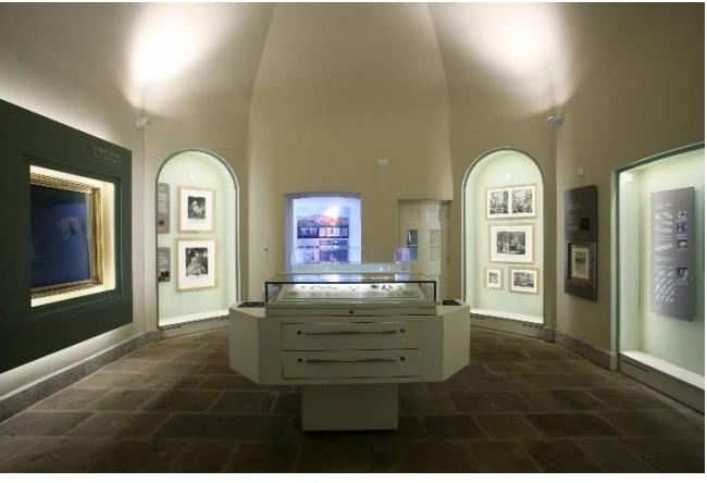
Interior. No 5 Vicars' Hill